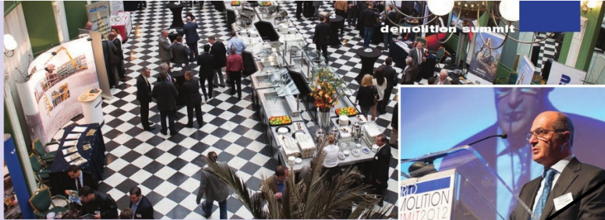
The audience gathers - just over 200 delegates were in attendance at this year's event